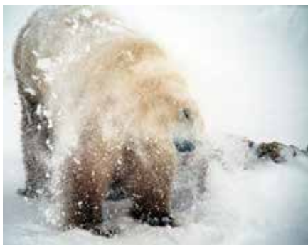
Arctic White Out with Polar Bear Archival Pigment Print 14 x 11