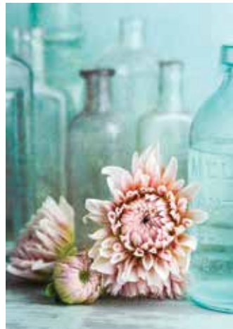
Pink Dahlia #2 Archival Pigment Print 7 x 10