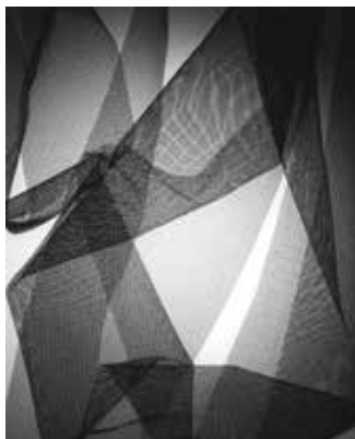
Screenscape #215, 2012 Gelatin Silver Print 9 x 11