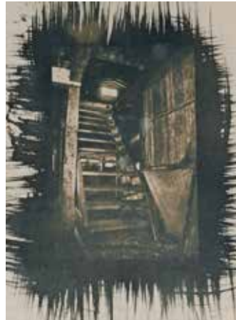
Old Barn Stairs, Waterloo, IN 2012 Tea Toned Cyanotype 5.25 x 7.5