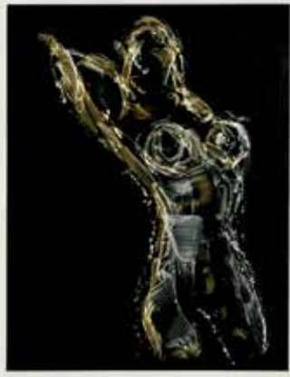
Cave Rock Figurine Chlorobromide Silver Gelatin Print with unique Chocolate Toner 7.5 x 10