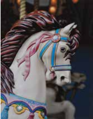
Carousel Horse Archival Pigment Print 9 x 11