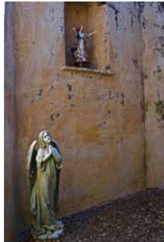
Icons at Carmel Mission, Carmel/ Monterey, CA Archival Pigment Print 11 x 17