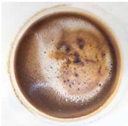
Grounds for an Investigation 0484 Archival Pigment Print 6 x 6 CHARLY BLOOMQUIST