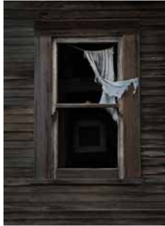
Looking In Archival Pigment Print 10 x 14