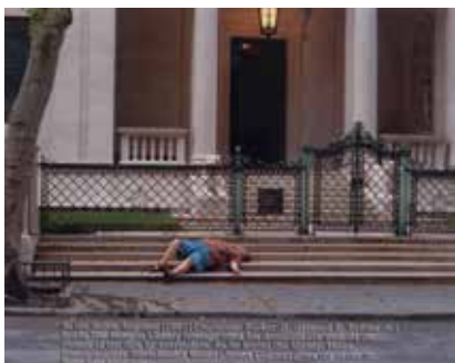
At the Morgan