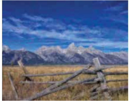
Wild West Metallic Standout 30 x 24