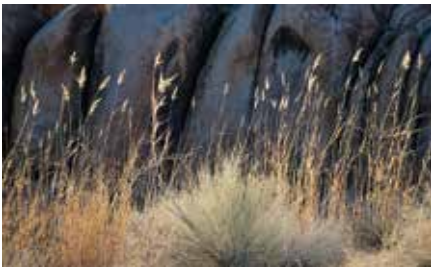
Sagebrush & Grasses Archival Pigment Print 18 x 11