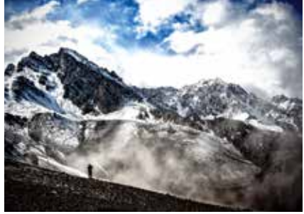
Chilean Andes Archival Pigment Print 18 x 12