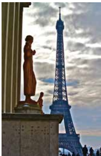
Blue Tower Archival Pigment Print 11 x 14