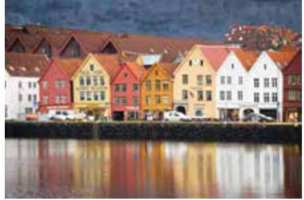
Bergen Archival Pigment Print 9 x 12