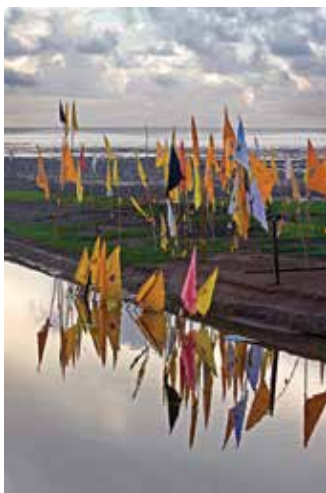
Hindu Holy Site, Guyana Archival Pigment Print 12 x 18