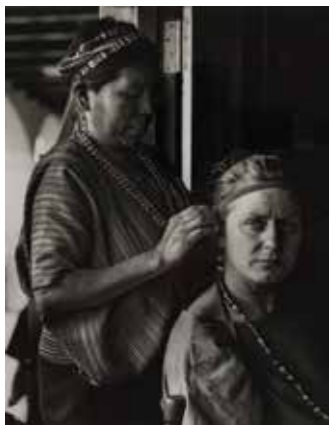
Two Women Gelatin Silver Print 8 x 10