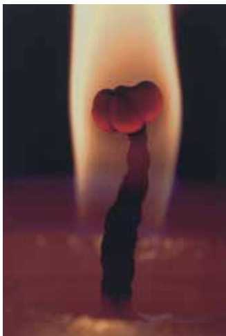
My Old Flame Archival Pigment Print 5.5 x 8 Donated by Craig Beal ALEXANDER LOWRY