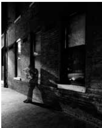
The Sporting News Archival Pigment Print 16 x 20