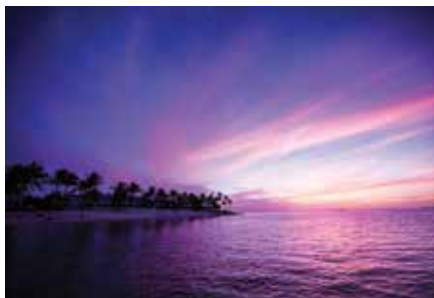
Key West Sunset Archival Pigment Print 18 x 12