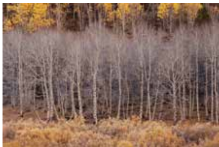
Aspen Forest, Inyo NF 2012 Archival Pigment Print 21 x 14