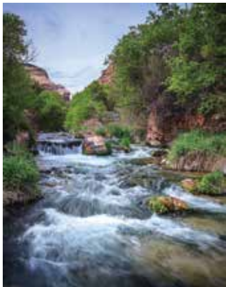
Jones Creek Archival Pigment Print 11 x 14