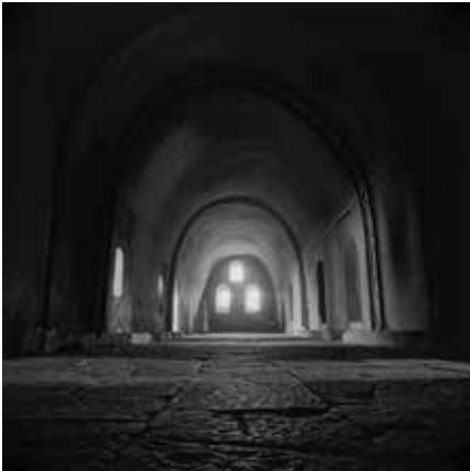
Man and Three Windows, St. Simeon Monastery, Egypt Gelatin Silver Print 13 x 13