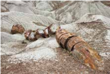
It Fell to Pieces Archival Pigment Print 18 x 12