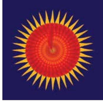
Sunshine Archival Pigment Print 20 x 20