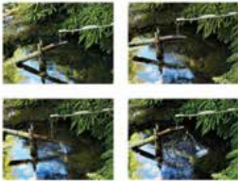
ShiShi Odoshi ( Deerchaser baboo fountain ) Archival Pigment Print 20 x 16