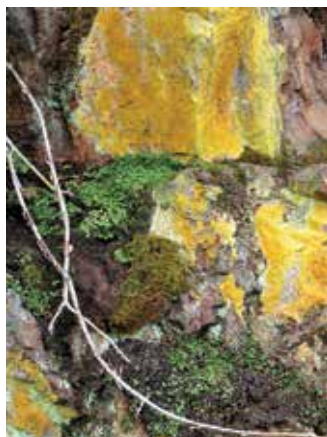
Lichen & Liverworts Archival Pigment Print 9 x 12