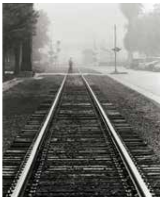
Phantom Pedestrian Archival Pigment Print 16 x 20