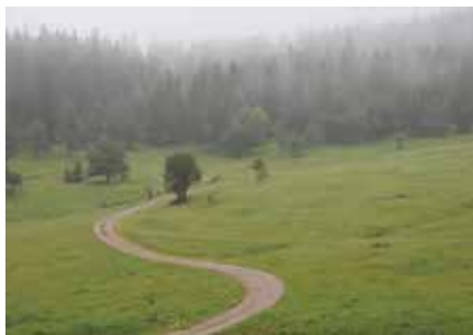
The Narrow Road to Eternity Archival Pigment Print 30 x 22 RAYMOND G. RODRIGUEZ