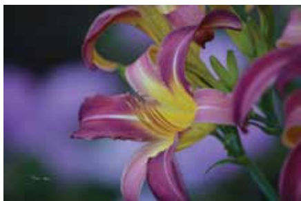
Carpe Diem Canvas Print 30 x 20