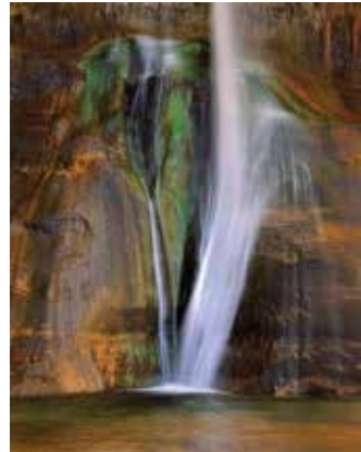
Calf Creek Falls, Escalante, Utah Archival Pigment Print 15.5 x 20