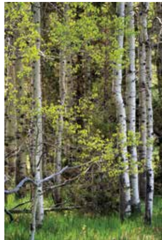
Spring Highlights, Eastern Sierra Archival Pigment Print 10 x 15