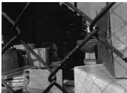
Has My Lawyer Called? Archival Pigment Print 7 x 5