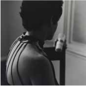
Untitled Gelatin Silver Print 10 x 10