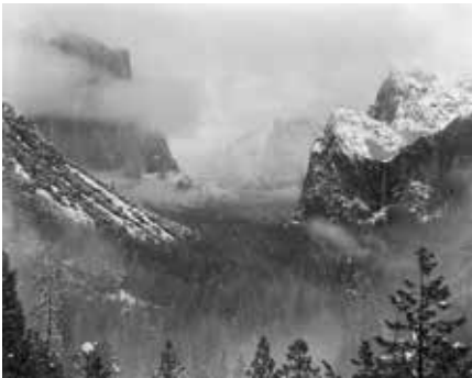
Inspiration Point, Yosemite NP Archival Pigment Print 19 x 15