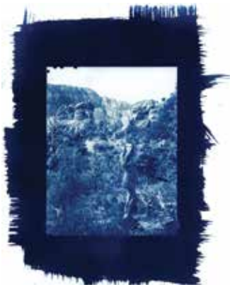
Untitled Cyanotype Print 4 x 5