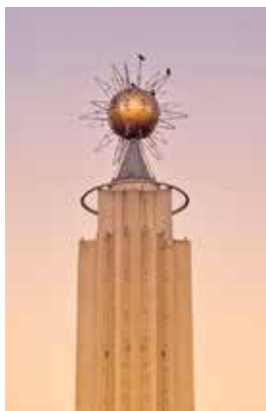
The Tower Chromogenic Print 8 x 12