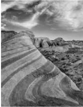
Wave Rock, Valley of Fire, AZ Archival Pigment Print 11 x 14