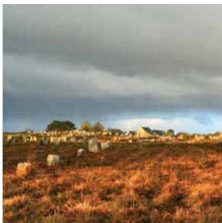
Menec Alignment, Carnac, France Archival Pigment Print 7.5 x 7.5