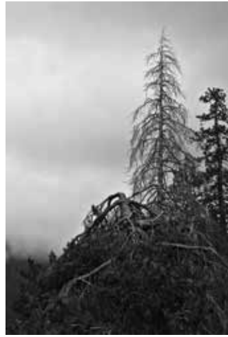
Stormy Day, Sequoia NP Archival Pigment Print 12 x 18