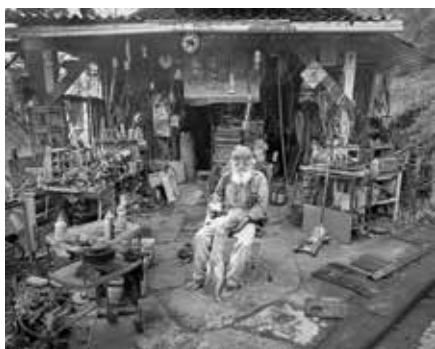
Roger Archival Pigment Print 19 x 15