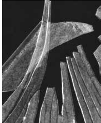
Broken Window #1 1953