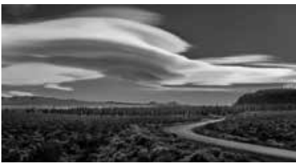
Wave Cloud, Owens Valley, CA Archival Pigment Print 20 x 11