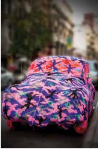
4-Wheel Drive to City Archival Pigment Print 12 x 18