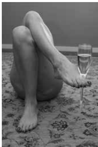
Jane (2-514) Archival Pigment Print 12 x 18