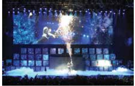
A KISS from the Back Row Archival Pigment Print 18 x 12