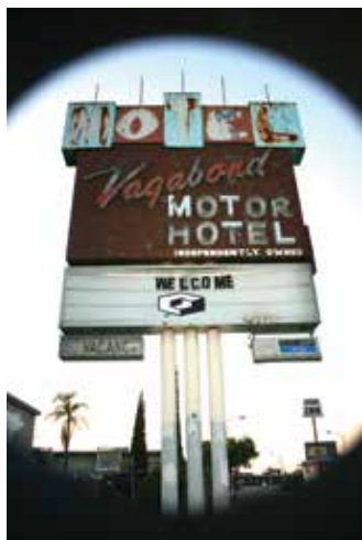
Vagabond Forever Archival Pigment Print 12 x 18