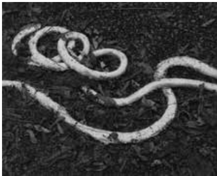
Rope-Pennhurst Asylum, PA 2008 Archival Pigment Print 13 x 10.5 Donated by Craig Beal