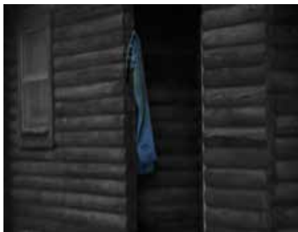
Blue Jeans Archival Pigment Print 13 x 10