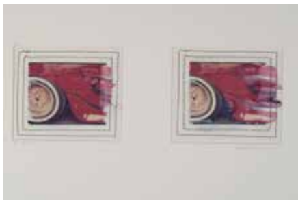
The Sportscar Polaroid Transfer on Silk 5 x 4 Diptych