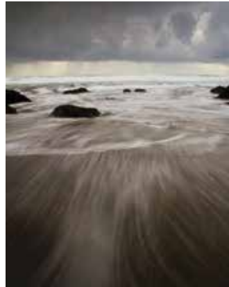
Mendocino Coast, 2012 Archival Pigment Print 11 x 14