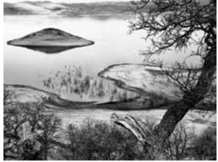
Millerton Reflection Archival Pigment Print 14 x 11