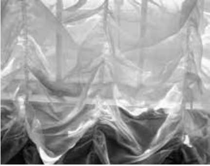
Window Curtain, Cerro Gordo, 2002 Gelatin Silver Print 12 x 10