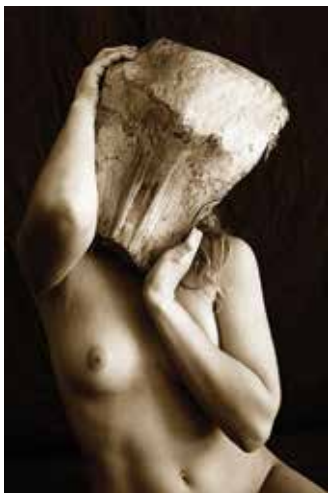
I, Object Archival Pigment Print 6.25 x 9.5