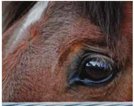
Horse Eye Archival Pigment Print 11 x 9