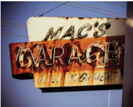
Mac's Garage Pigment Emulsion Transfer on Fine Art Paper 15 x 12