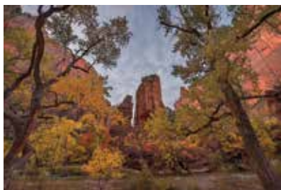
Temple of Sinawawa Archival Pigment Print 20 x 16