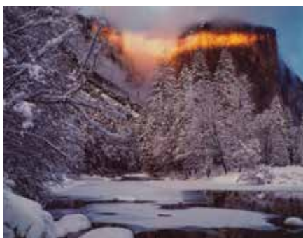
El Capitan, Winter Sunset, Yosemite NP, CA Cibachrome Print 20 x 16