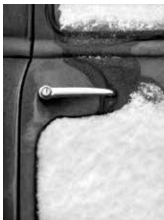
Melting Snow, Wyoming Archival Pigment Print 10.75 x 13.75