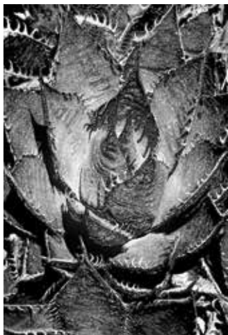
Altered Aloe Archival Pigment Print 10.5 x 13.25