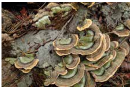
Turkey Tail Fungus Archival Pigment Print 21.5 x 14.5