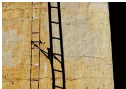
Under the bridge ladder Fuji Crystal Pearl Print 12 x 8