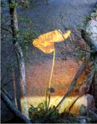
Sundown Poppy Archival Pigment Print 11 x 14