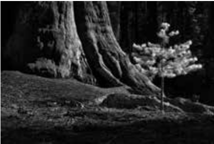
Some Day Archival Pigment Print 24 x 16