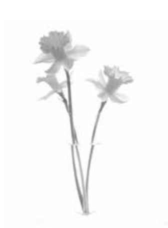
Daffodils Archival Pigment Print 11 x 14