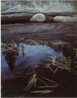
Zen Pool, Yosemite NP, CA Cibachrome 16 x 20