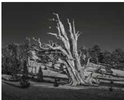
Bristlecone and Moon Archival Pigment Print 20 x 16