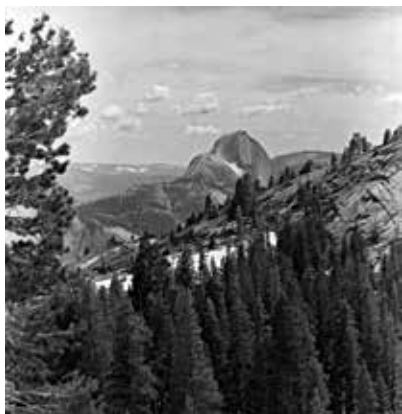
Yosemite Valley from Tioga Road