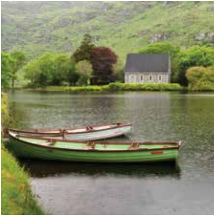
Gouganebarre Archival Pigment Print 12 x 12