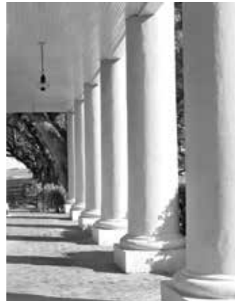
White Columns, Oak Alley Plantation, Louisiana Archival Pigment Print 11 x 14