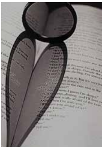
Untitled Archival Pigment Print 8 x 12