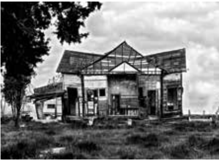
Abandoned Dream Archival Pigment Print 14 x 11