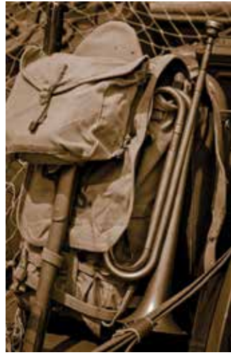
Fallen Reveille Archival Pigment Print 12 x 18