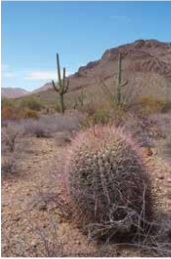
From AZ with Love Archival Pigment Print 12 x 18