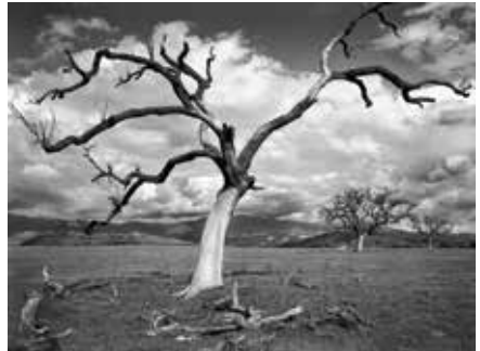
Three Trees - Santa Ynez Valley, CA Archival Pigment Print 16 x 12