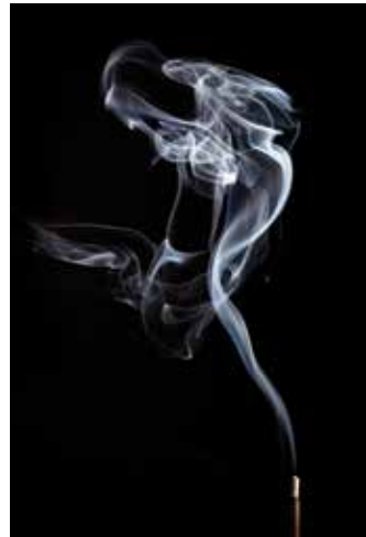
Spectre Archival Pigment Print 12 x 18