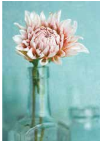
Pink Dahlia #1 Archival Pigment Print 7 x 10