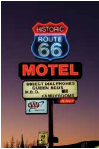
Get Your Kicks Archival Pigment Print 12 x 18