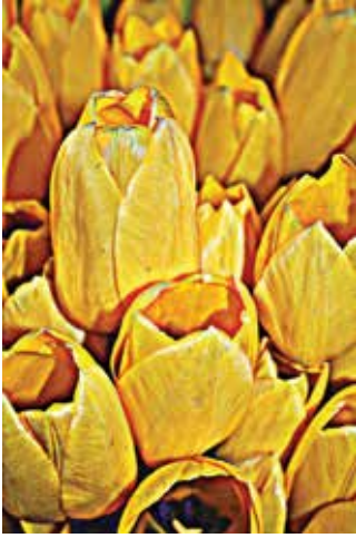
Tulips Chromogenic Print 16 x 24