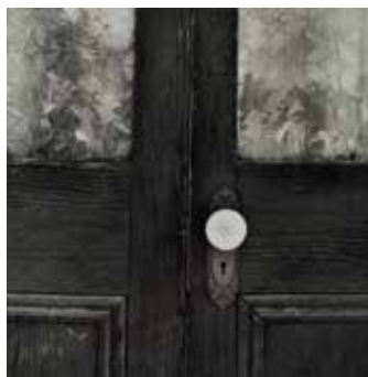
White Knob Gelatin Silver Print 10.50 x 10.50