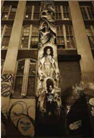
Amy, New York City Gelatin Silver Print 10.25 x 15