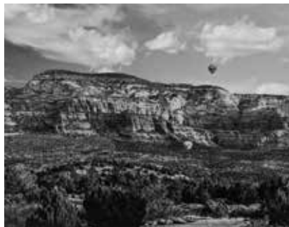
Balloon Ride Archival Pigment Print 14 x 11