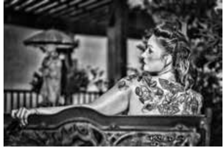
1208_Angel Archival Pigment Print 18 x 12