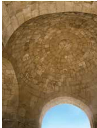
Circles and Sky, Jerash, Jordan Archival Pigment Print 11 x 15