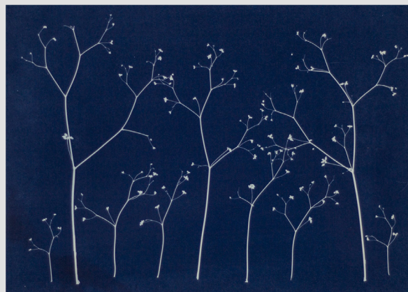
Erigonum inflatum