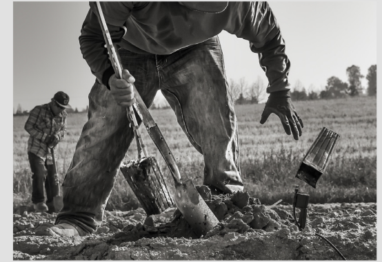
Planting Almond Sapling Jim Cumyn