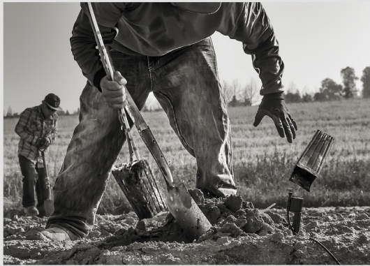
Planting Almond Sapling