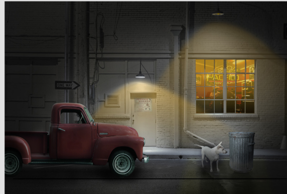
My Dog Gumbo

Many of the gallery activities are available to members only, usually at no fee or a reduced fee.