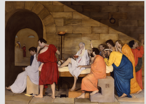
History of Practical Jokes

Please enclose this form, along with your payment to Spectrum Art Gallery either in person or by mail to Spectrum Art Gallery, 608 E. Olive Ave, Fresno, CA 93728. Please make checks out to Spectrum Art Gallery. By submitting, applicant agrees to abide by the guidelines and operational rules of Spectrum Art Gallery and agrees to attend the first available membership orientation.