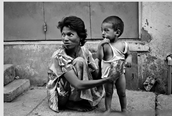
My Child, India

Forty (40) hours per year volunteer service. There are many great ways to serve, including gallery sitting, committee participation or other board approved activity.