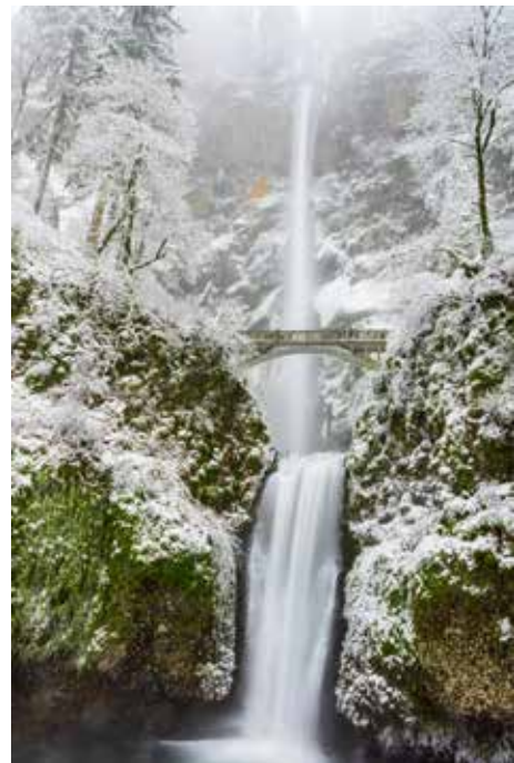
Multnomah Falls