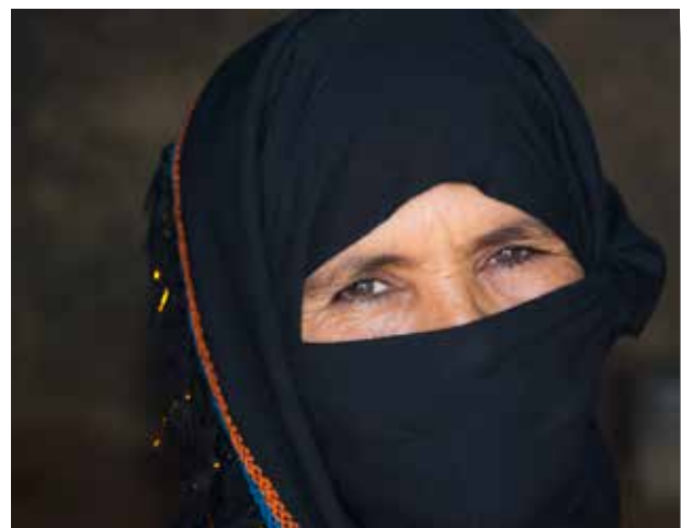
Eyes of the Sahara, Morocco Karen Tillison

She was shooting mostly nature and landscapes in and around the Sierra Nevada mountains until she started traveling overseas. Her first international trips were in 2001 to Africa, on a safari, and then to Egypt where she developed a whole new area of photography. She has visited all seven continents in her travels, going to some many times. Her landscape photography took a backseat at this time and she turned to photographing people and their cultures. She has met many interesting people that she has interacted with as