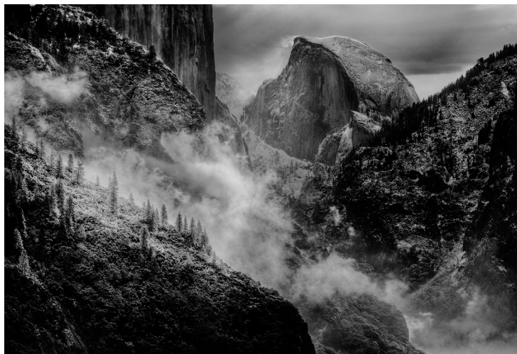
Tim Fleming Half dome and Elcapitan Snow storm 2012

In 1978 to 1981, I traveled to cities in the Western states to sell my landscape photos at art shows and crafts fairs. My brother and I flew and sold Hang gliders during this time period, and we traveled to many hang glider mountain flying 2