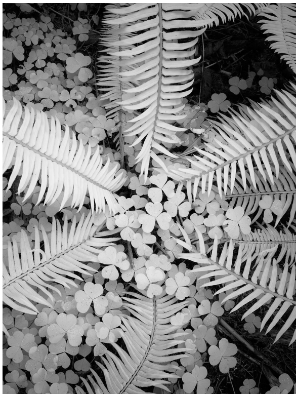
Tim Fleming Ferns and Clover Infrared Oregon Coast

I will display images from the eras listed below.