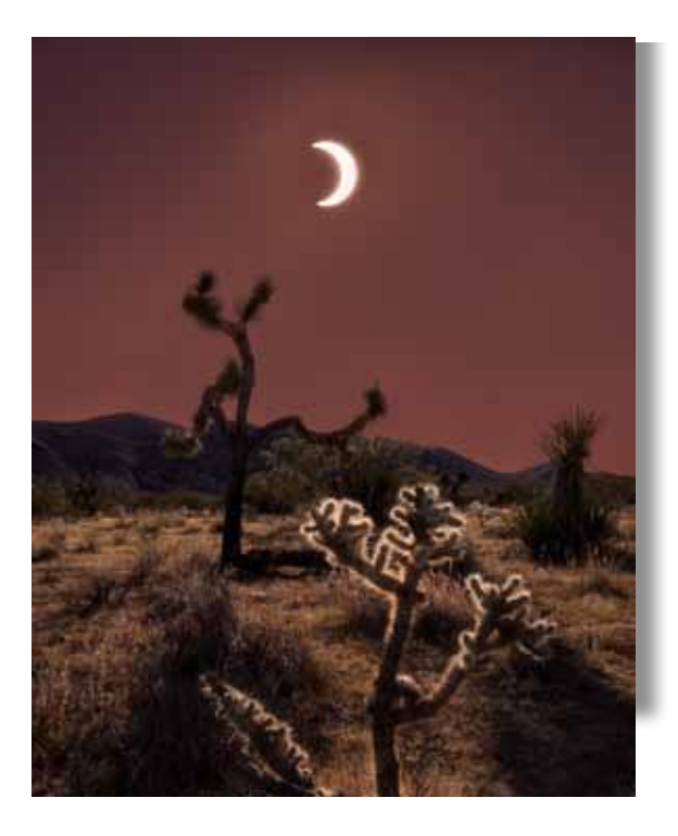
Joshua Moulton Joshua Tree Eclipse