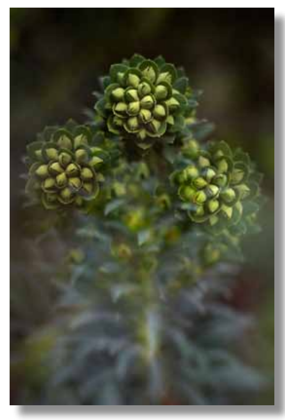
Victoria Flores Verdant

The phrase, Menagerie of Light, evokes the idea of a diverse and vibrant collection of light sources or visual effects, similar to how a menagerie is a collection of various animals. It suggests a scene that is rich, varied, and possibly magical or enchanting in its visual impact. In the context of photography, a menagerie of light refers to the diverse and intricate ways light is captured and manipulated in an image.