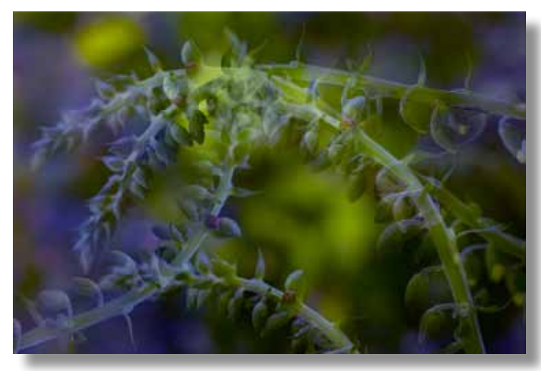
Victoria Flores Ladybug Lush

Victoria's inspiration for her images comes from chasing light and discovering interesting organic shapes. She truly enjoys exploring and capturing moments of natural beauty. While photographing botanicals might seem mundane to some, she finds it exciting. By using multiple exposures on her digital